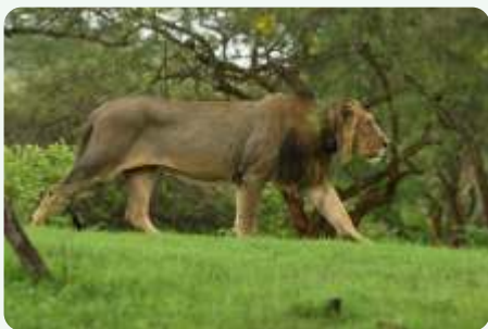
Gir National Park