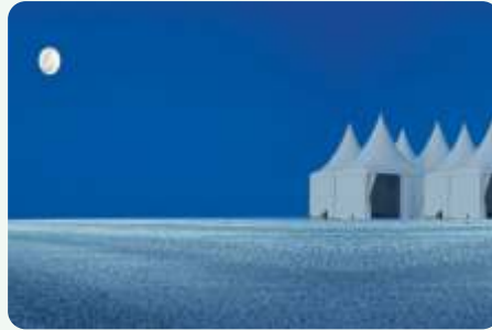
Great Rann of Kutch