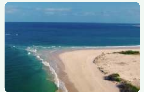
Shivrajpur Beach, Devbhoomi Dwarka