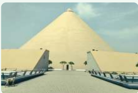
Dandi Kutir Museum, Gandhinagar