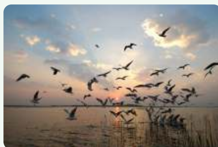
Nalsarovar Bird Sanctuary