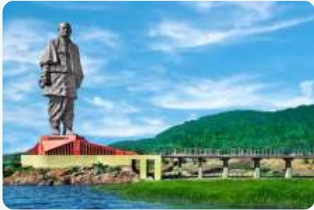
Statue of Unity