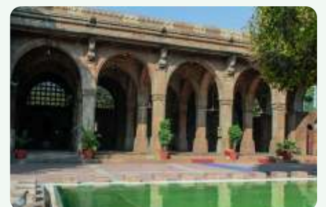
Sidi Saiyed Mosque