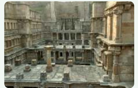
Rani ki Vav, Patan